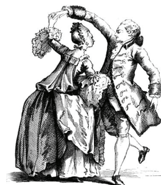
Costume Model: ©Pittier ca. 1758. (Paris) Selva-Ardin.