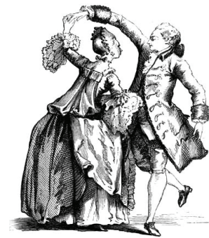
Illustration by John G. Johnson, 1755.

Sep. 12 - Open Sep. 26 - Open Oct. 3 - Demo Oct. 10 - Open Oct. 24 - Open