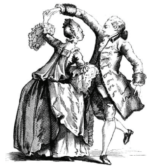
Costume: 18th C. Photo: 1758. Photo: S. S. S. S. S.

Jun. 6 - Demo Jun. 13 - Open Jun. 27 - Open Jul. 11 - Open Jul. 25 - Open