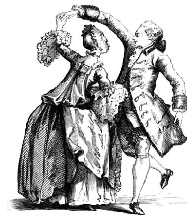
Costume: Isabelle d'Elise on 1709. Photo: Saint-Aubin

Begins at 7:00 p.m. Bring your dance shoes and finger foods to share!