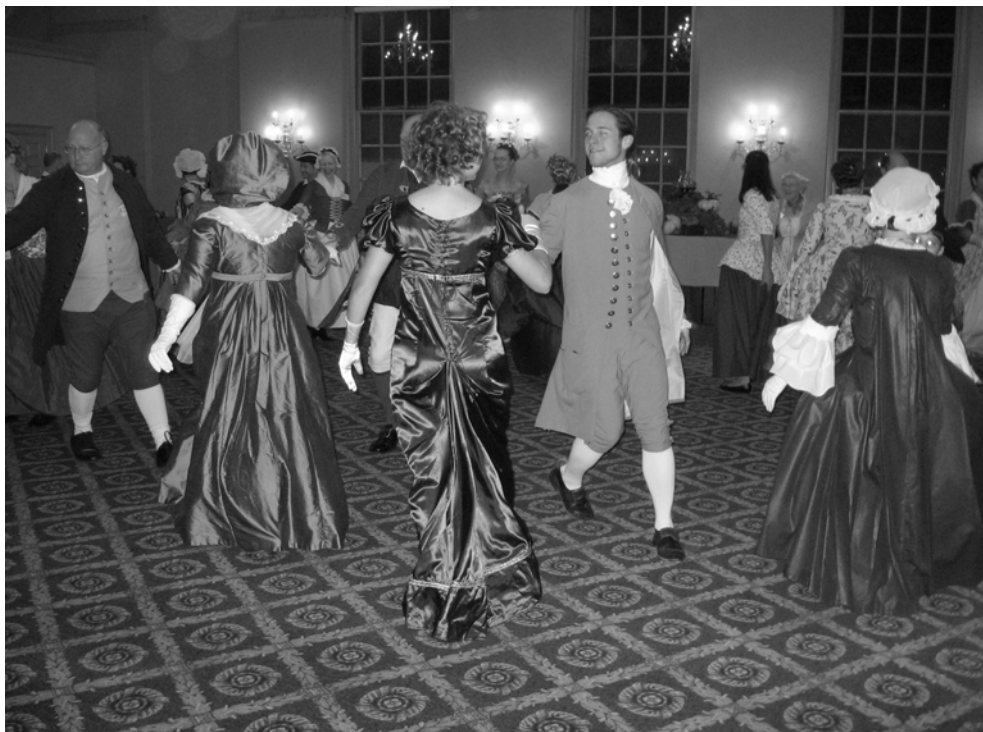
Dancers Having a High Time at the Fall Ball