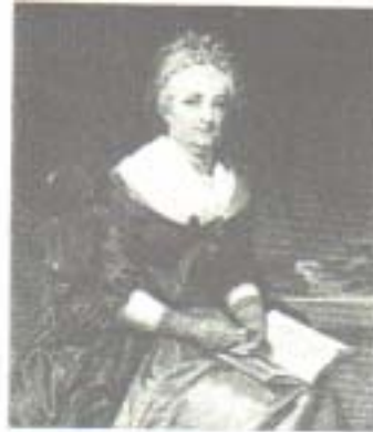
First Lady 1789-1797

George Washington, we all agree, was a great man and a great American. We learn about our first president from early childhood and celebrate his birthday with a national holiday. But, behind this great man there was a dynamic woman, Martha Dandridge Custis Washington. Barely five feet tall, plump, pleasantly attractive, accomplished and well mannered, she is often referred to as the "Mother of our country".