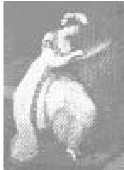
Sultana Costume or Turkish Masquerade Dress (right) Angelica kaufman's Morning Amusement , c. 1773 (privately owned)

For more information check these websites: